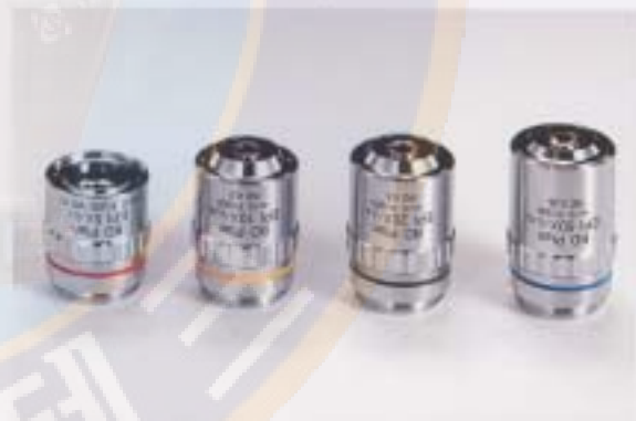
PLAN EPI OBJECTIVES