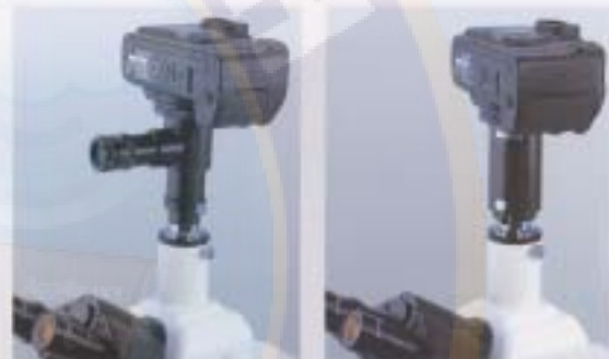
MA150/50 Camera attachment MA150/50 Camera attachment

These attachments are used to mount the camera with T2 adapter ring to the photo tube.