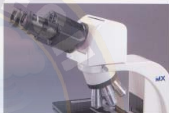
MA957 ERGONOMIC TILTING BINOCULAR HEAD (SIEDENTOPF TYPE)